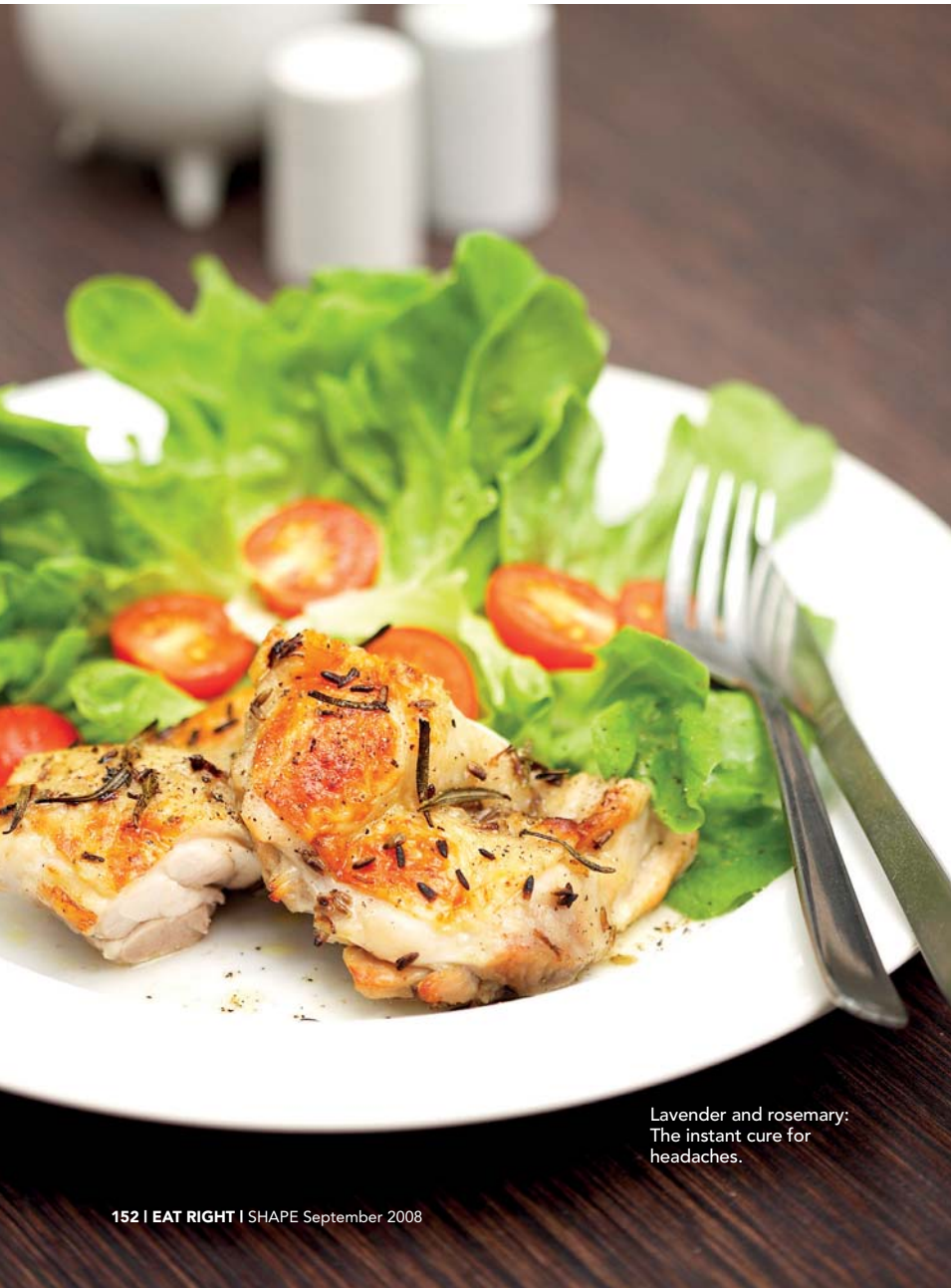
Lavender and rosemary: The instant cure for headaches.

● Add dried hibiscus to hot water at 80-90 deg C for 90 seconds; any hotter and the flowers will taste bitter. Add lime juice and ice cubes into cups, pour in the hot tea and serve.