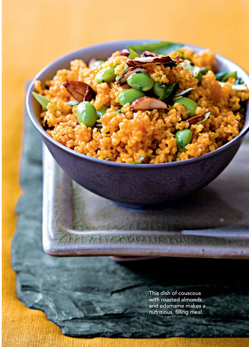
This dish of couscous with roasted almonds and edamame makes a nutritious, filling meal.

229 calories, 9g fat (36 per cent of calories), 1g saturated fat, 2g carbs, 35g protein, <1g fibre, 34mg calcium, 2mg iron, 321mg sodium